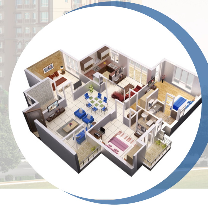
3 BHK: super area: 1750 sq ft