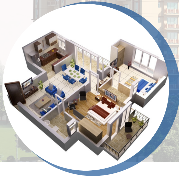
2 BHK: super area: 1215 sq ft