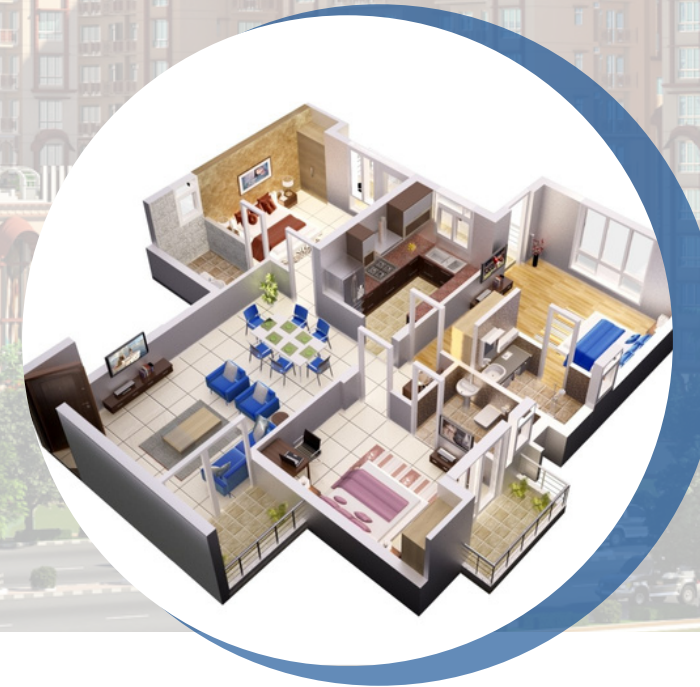
3 BHK: super area: 1605 sq ft