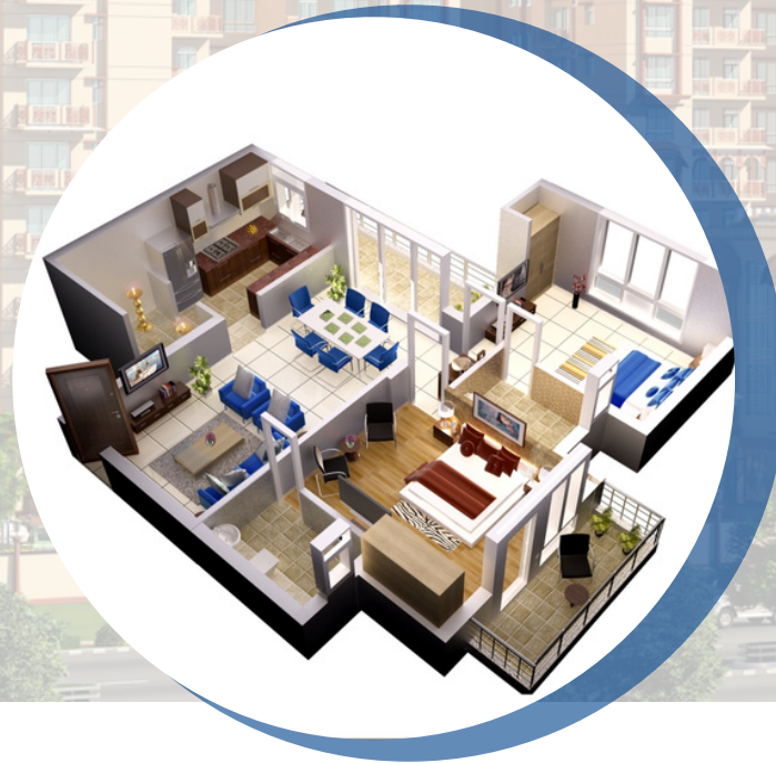
2 BHK: super area: 1275 sq ft